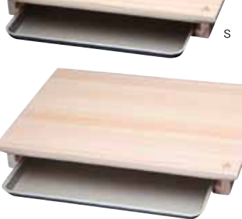
FSC Hinoki Cutting Board with Tray