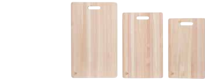
FSC Hinoki Cutting Board Grip Hole