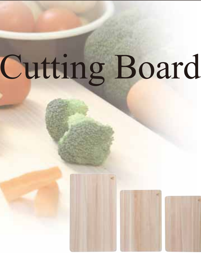
FSC Hinoki Cutting Board Thin Type