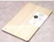
FSC Hinoki Cutting Board with Urushi Thin Type