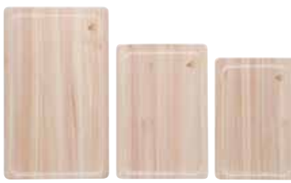
FSC Hinoki Cutting Board Grooved