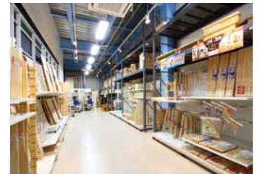
Sales floor simulation room

We focus on manufacturing products that harness the texture and subtleness of natural timber and meet the needs of consumers. Product marketing, planning, design, packaging and sales floor testing in our simulation room is all performed independently by Kodai Sangyo.