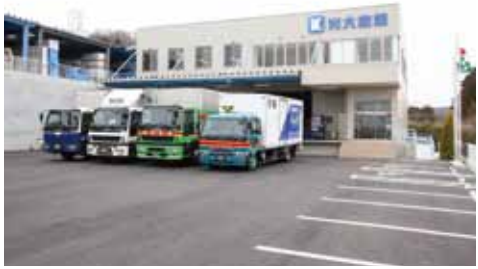
Head office premises