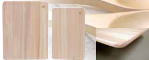
FSC Hinoki Cutting Board for Bread and Cheese

ひのきのまな板は包丁を傷めず切れ味を長持ちさせます。また、抗菌成分「フィトンチッド」が雑菌やカビなどの発生を押さえ、清潔さを保ちます。自然の成分で体にやさしい成分ですので安心してご利用いただけます。