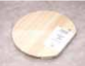
FSC Hinoki Grooved Cutting Board (D Type)